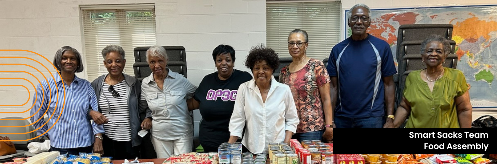
Smart Sacks Team Food Assembly