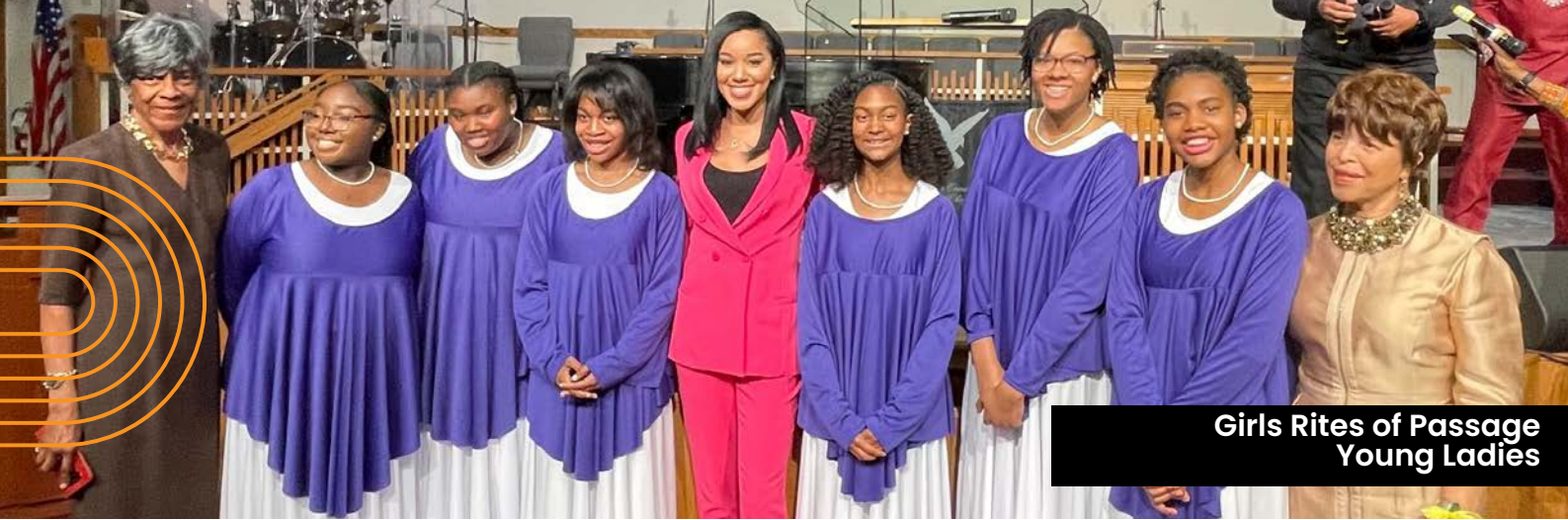
Girls Rites of Passage Young Ladies