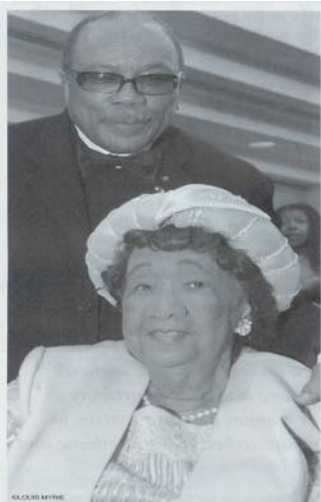
Dr. Height and Quincy Jones at the Uncommon Height Gala