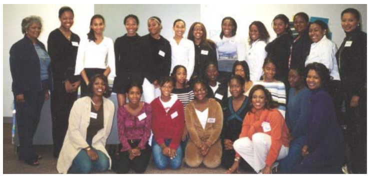
Above: Rites of Passage members and leaders